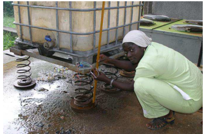
Figure 1. Mixing tank suspended on five springs.

A 1000 liter mixing tank which also serves as the digester was suspended on springs recycled from the shock absorbers of automobiles. Five springs were used to support the weight of the tank when filled with substrate and also to facilitate mixing of the slurry (figure 1). Proper mixing with adequate water is necessary to get an even paste and to predict using pre-determined model for the slurry the densities of organic materials.